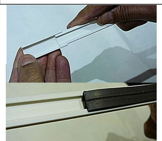
4. Connect the plastic profiles together on each side by sliding or pressing on the joining pieces. You may need to cut to length